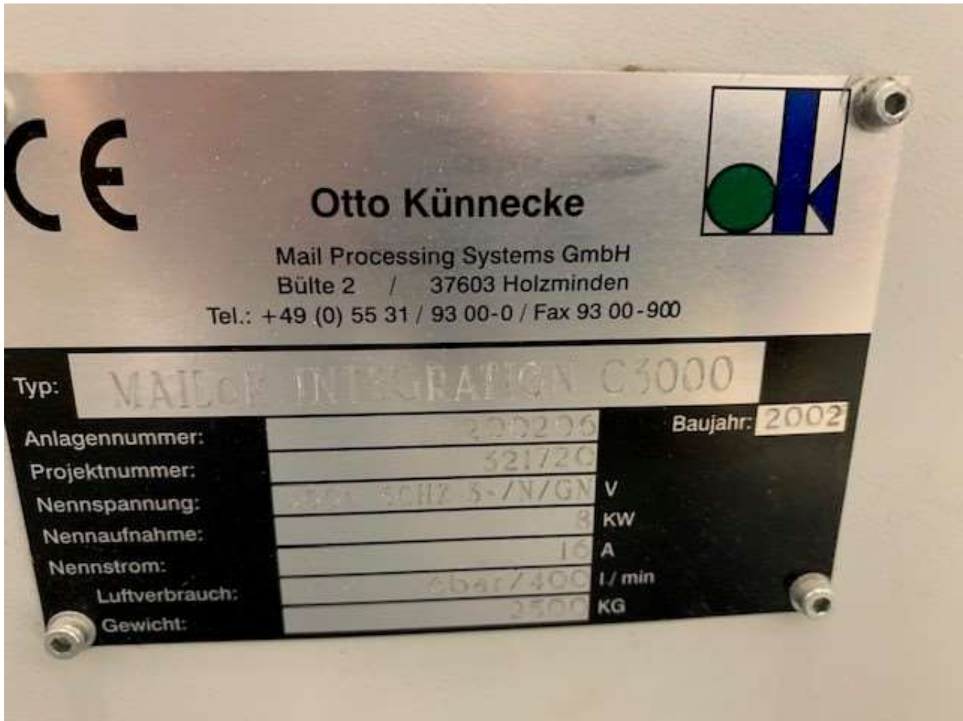
C3000 5: Type Plate