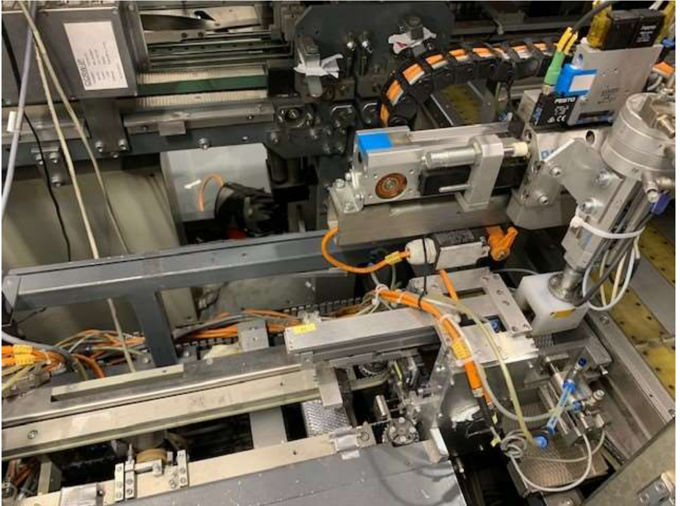
C3000 1: Application Station