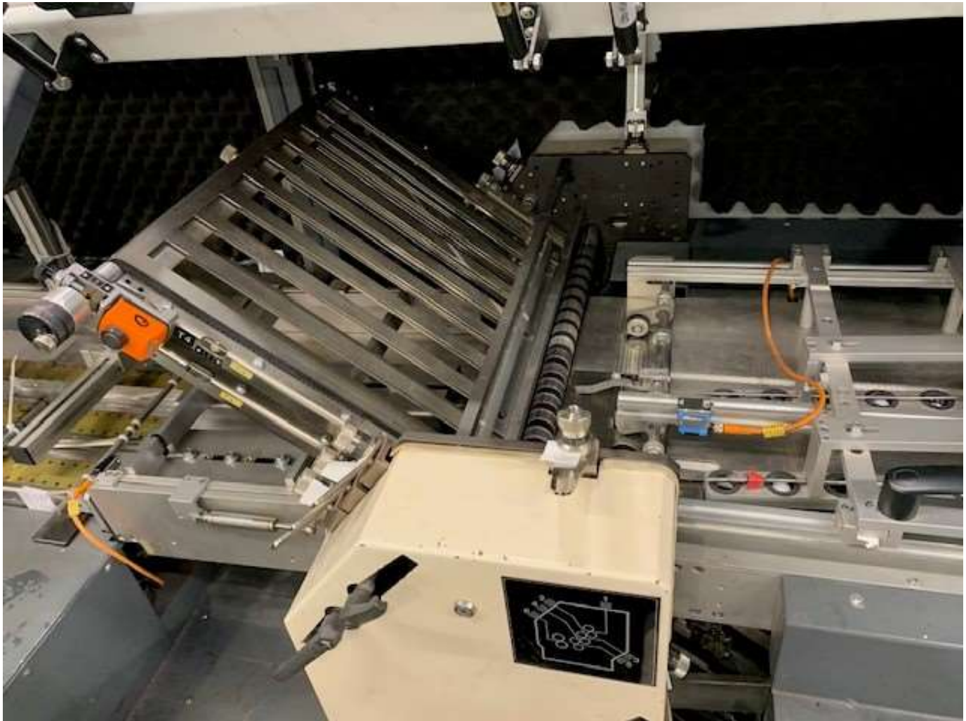
C3000 3: Folding Unit