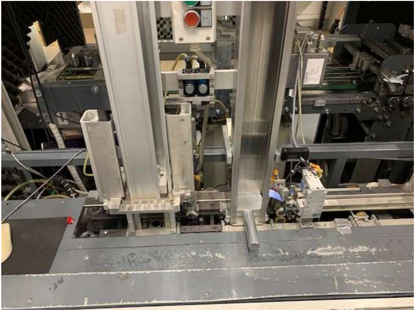
C3000 4: Card Magazines